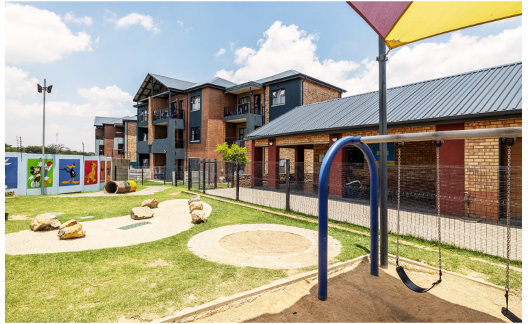
51 m 2 | 2 bed | 1 bath