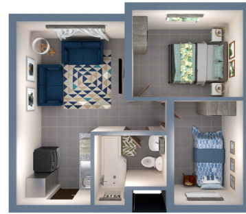
40 m 2 2 bed | 1 bath