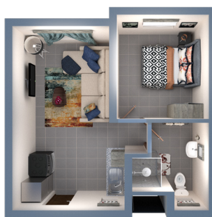
34 m 2 1 bed | 1 bath