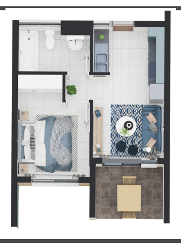
56 m<sup>2</sup> | 2 bed | 1 bath