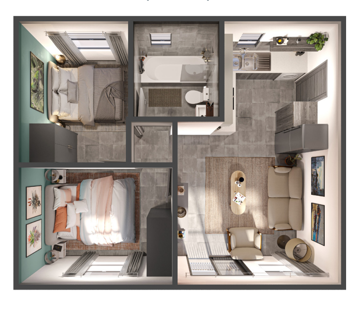
51 m<sup>2</sup> | 2 bed | 1 bath