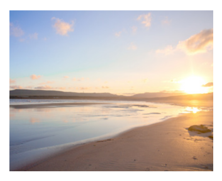
Hidden gem of the Garden Route